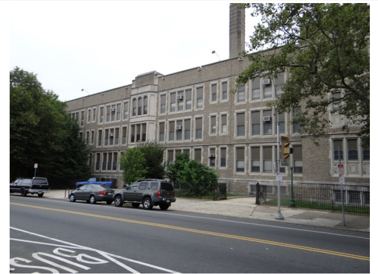
Main Façade(s): Looking N at SW facade