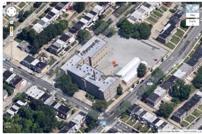
Aerial View: Google Earth (downloaded 2014) N ↑