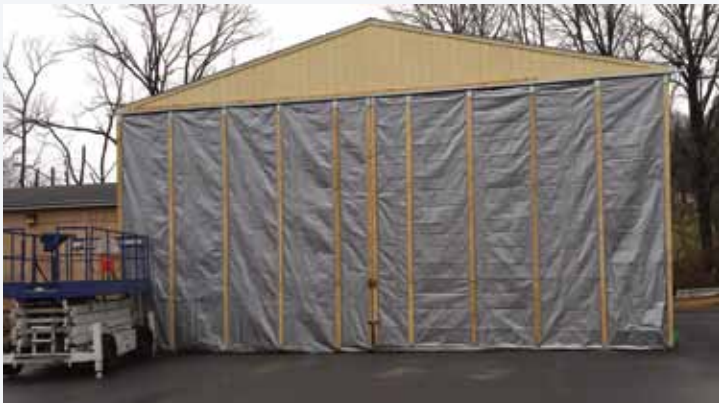
This salt shed entrance curtain keeps rain from getting inside a salt shed and contaminating stormwater runoff. Whitehall Township, Lehigh County, 2017 First Place Winner

Check out these innovative winning entries from the last couple years: