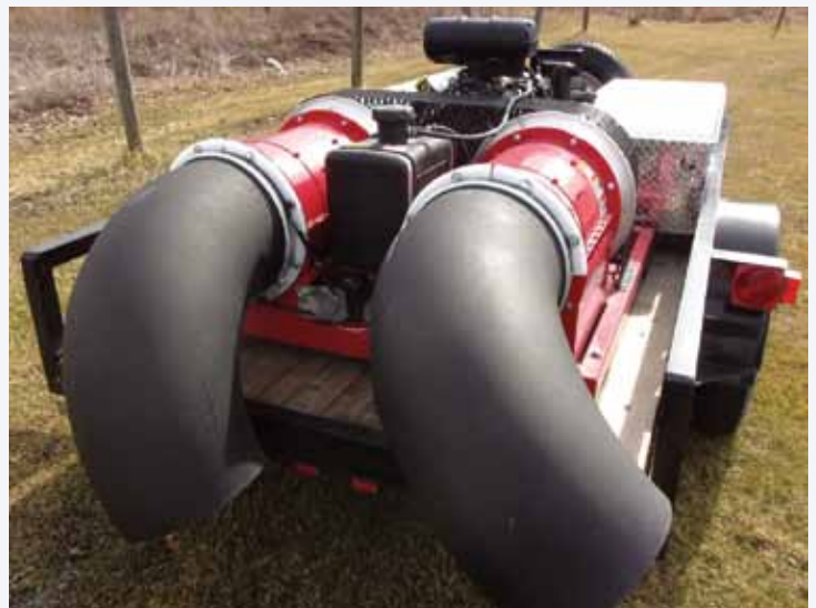
This road ditch cleaner can blow a ditch clean of leaves and debris without removing the beneficial vegetation that holds soil in place. Armstrong Conservation District, 2016 Runner-up