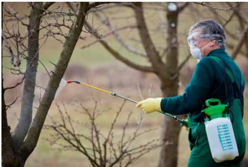
To become a certified pesticide applicator, an individual must pass a two-part written examination for both core and category and be employed by a pesticide application business.

To maintain a pesticide certification, applicators must take update training during three-year intervals by accumulating PDA-approved category-specific credits in addition to six core credits. Each certified applicator is mailed an annual statement of credits, which outlines credit requirements and the recertification renewal date. If the recertification credits are not met by the specified date, the applicator's license will expire, and the individual will no longer be able to apply pesticides until the license is reinstated. The individual may be reinstated if training is completed within one year of expiration; otherwise, the individual must retake the two-part written exam.