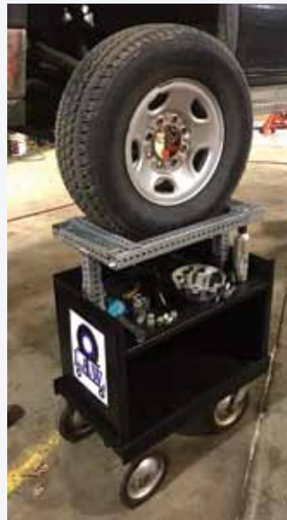
This lift assist makes it easier to mount heavy wheels onto equipment. Horsham Township, Montgomery County, 2017 Runner-up