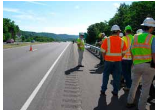
This 6.3-mm thin asphalt overlay is applied on SR 220 in Lycoming County. The specification for this pavement preservation technique was recently approved for incorporation into PennDOT Publication 408 and will take effect April 2018.

Pavement preservation is one of the Federal Highway Administration’s (FHWA) Every Day Counts Round 4 (EDC-4) initiatives. The initiative is broken into two parts: