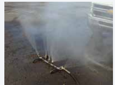
This high-pressure undercarriage sprayer removes corrosive salt and residue from the underside of trucks and equipment. Swatara Township, Dauphin County, 2016 First Place Winner