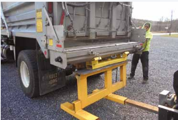
This system of heavy-duty shelving with a sliding mechanism makes it easier to store a tailgate spreader and install it onto a truck without having to put it down and lift it again. South Manheim Township, Schuylkill County, 2017 Runner-up